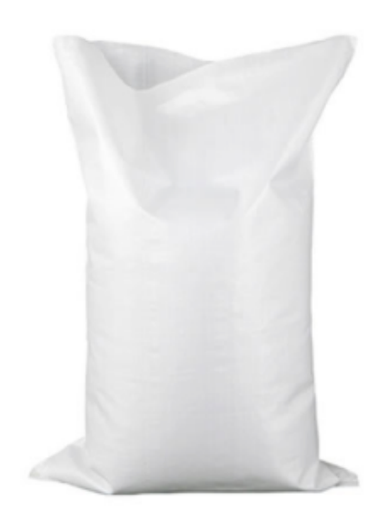
25 KG BAG