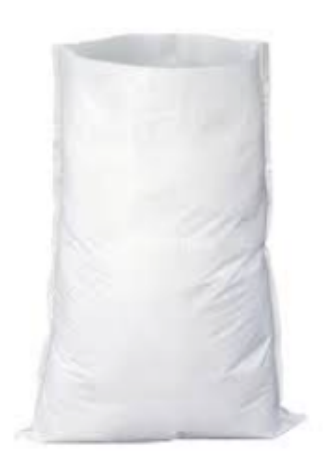
5 KG BAG