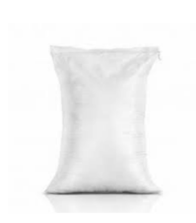
1 KG BAG